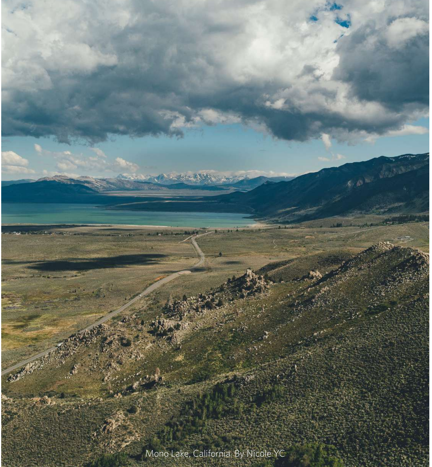
Mono Lake, California.